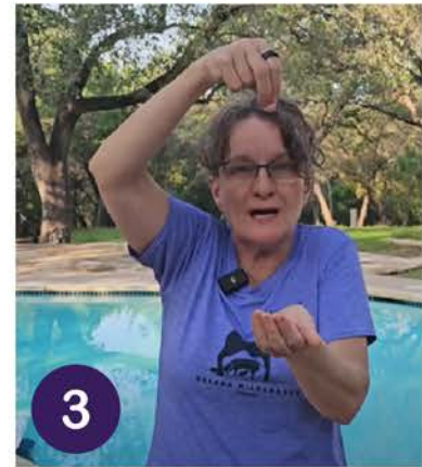
3 Cup hand when treat dropped.