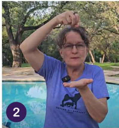
2 Flatten hand.