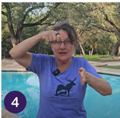
4 Firm, flat hand facing dog - say “cook”.