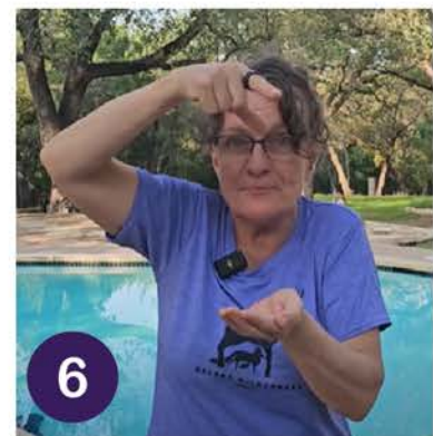
6 Drop treat into cupped hand.