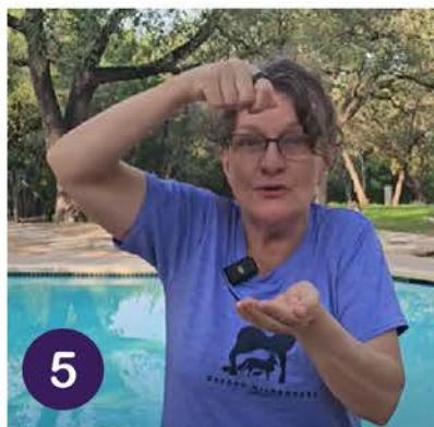
5 Turn hand and cup it to catch treat.