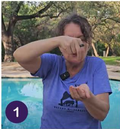
1 Drop treats into cupped hand.